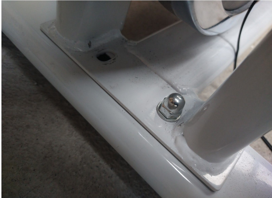
3: Insert handlebar post into frame